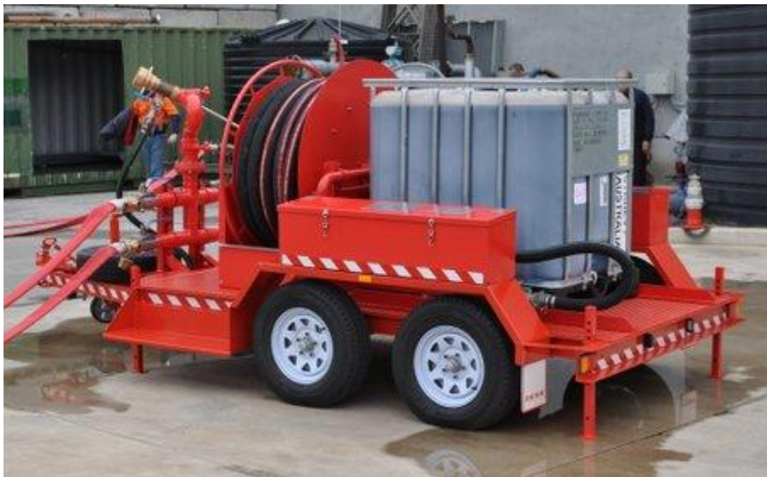
1000 Tote Litre Trailer with 64mm dia concentrate suction hose reel and Warden 8035 & NF8005 monitor and nozzle