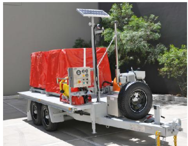
2000 Litre Trailer c/w foam concentrate transfer pump & hose reel and solar battery charger

* Stainless Steel Monitors are available.