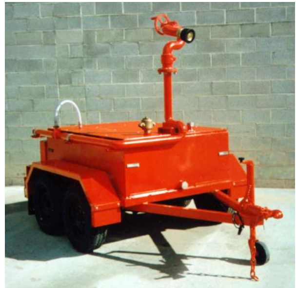
1000 Litre Trailer c/w Warden 8060 & 6000 Fog Nozzle & 65mm Line Proportioner