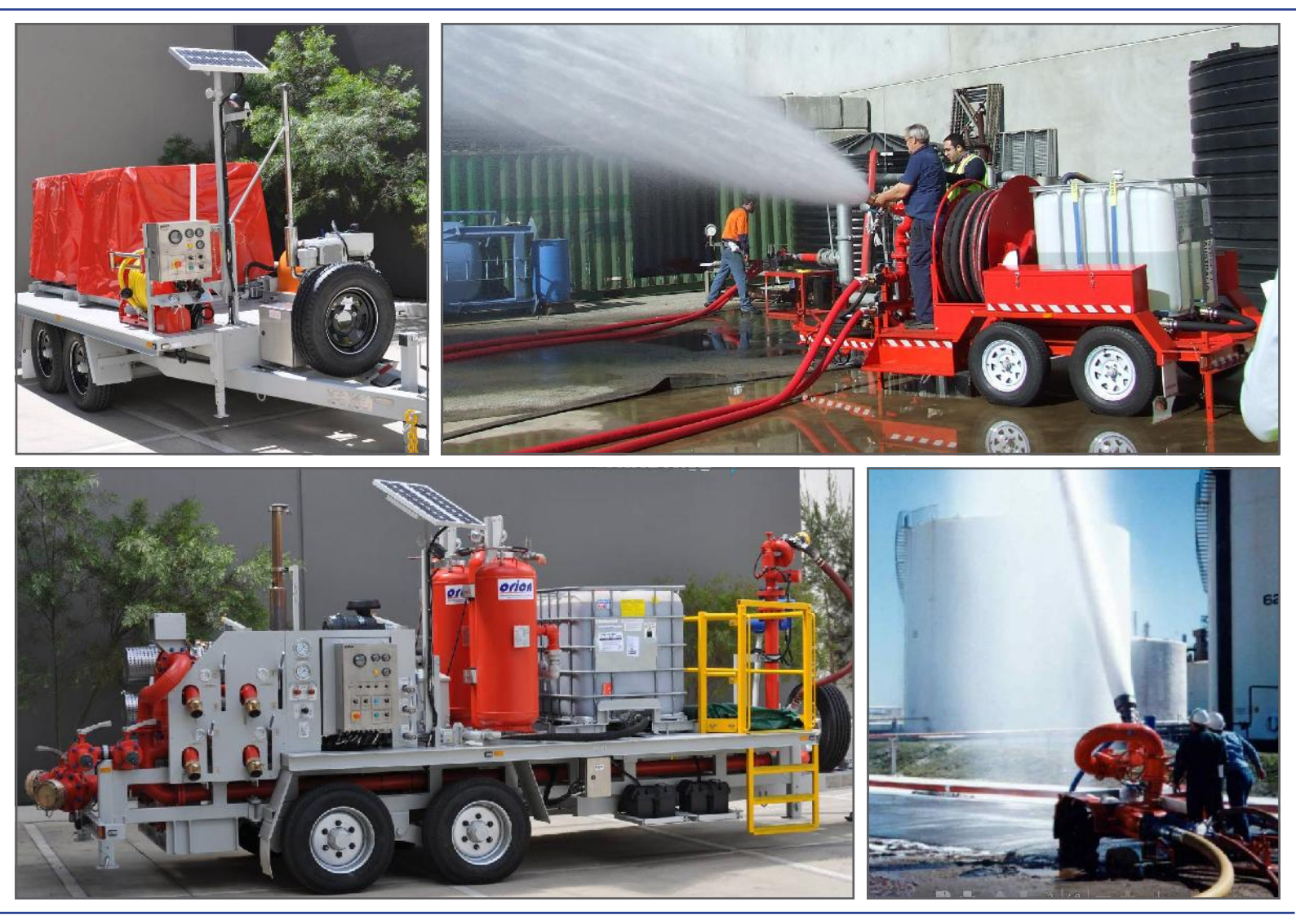
(Top Left) A foam transfer trailer with 2 x foam IBC's and a diesel driven foam pump and hose reel. (Top Right) Our tote trailer incorporates a monitor and foam IBC, and can also include a hose reel. (Bottom Left) Our premium fire fighting trailers contain diesel driven pumps, on-board dry chemical and foam proportioning systems, a fire monitor and delivery points. They also include solar charging to ensure the trailer is ready whenever you need it. (Bottom Right) Our longreach trailers include an 8" monitor which can be connected to the fire hydrants to deliver impressive throw capabilities.

Our trailers are designed and built to the highest quality, ensuring that they will not let you down in an emergency.