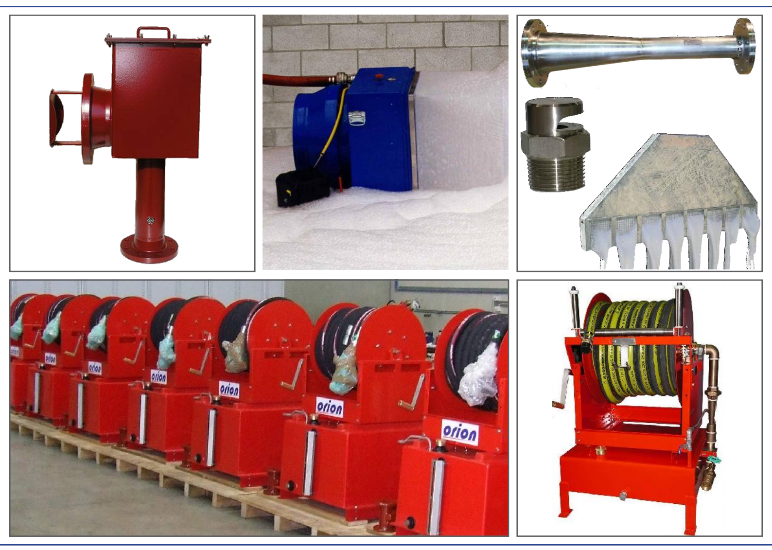
(Top Left) A 4" foam chamber (Top Middle) A portable high expansion foam system. (Top Right) A high back pressure foam maker, selection of cooling nozzles, and a foam pourer. (Bottom Left) A number of foam hose reels. (Bottom Right) A foam hose reel with 30m hose.

Our range of hose reels are designed for tropical and arctic environments, and are made from highly corrosion resistant materials for offshore service as well as more conventional materials for onshore plant. They can be standalone hose reels, or combined with an integral foam tank to provide foam solution to a local fire.