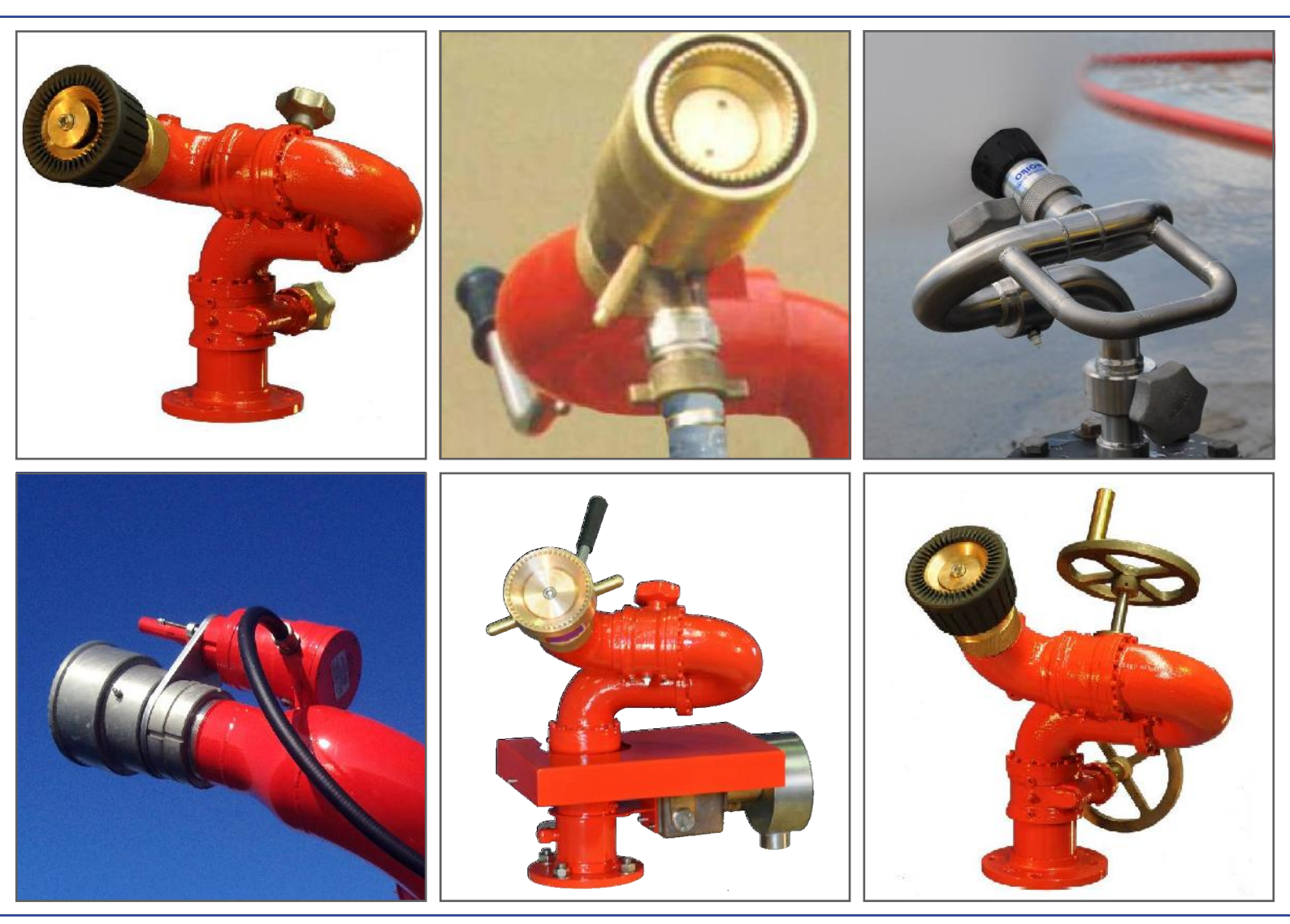
(Top Left) Our Warden friction lock monitor accompanied with an adjustable spray/jet nozzle. (Top Middle) A foam inducting FLD nozzle with adjustable spray/jet. (Top Right) Orion Sentinel SS316 Monitors are a lightweight manual monitor with friction locks. They have a balanced design with no net reaction force and an even weight distribution for easy operation. (Bottom Left) Our premium hazardous area remote controlled nozzle. (Bottom Middle) Our water oscillating monitors use water power to oscillate the monitor in the horizontal axis up to 120 degrees. (Bottom Right) Our Warden handwheel operated monitor

Our range includes manual monitors, water oscillating, hydraulic and remote controlled monitors. All of these are accompanied by our range of nozzles, including straight jet, fog nozzles and foam inducting nozzles. Our design allows the nozzles to be removed from the monitor to maximise flexibility and minimise maintenance.